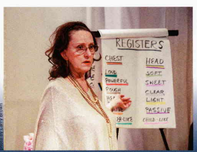
LoVetri discusses vocal registers, a key ingredient in Somatic Voicework.